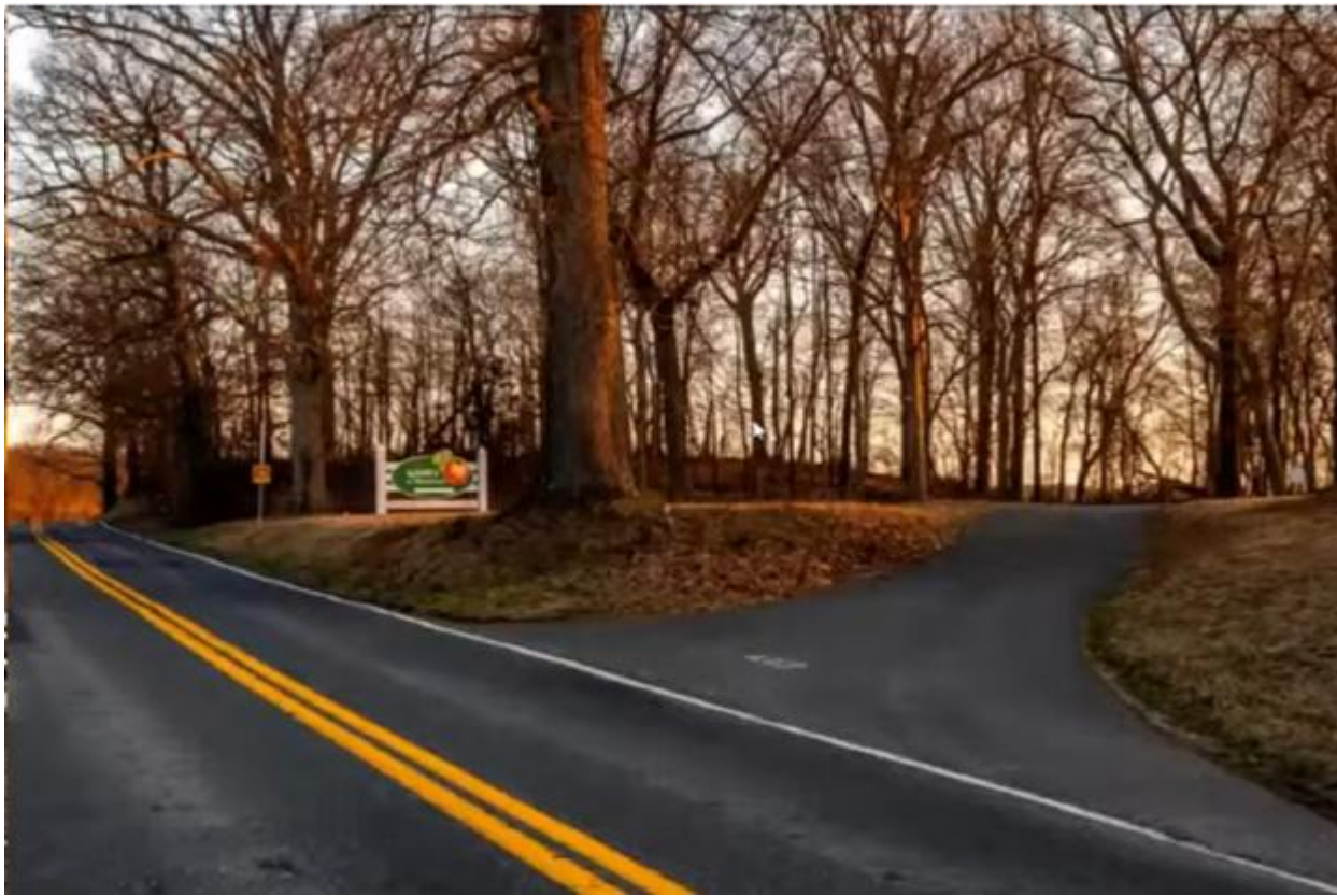
Entrance along Jennings Chapel Rd.