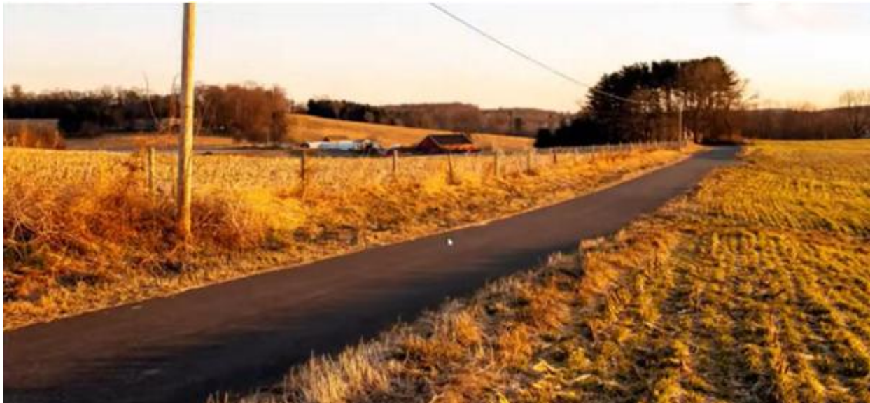
Continue down the one-way farm lane