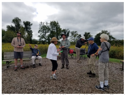
Birders gather at the Robbins' Skywatch, Mt Pleasant, Howard County Conservancy, on September 30.