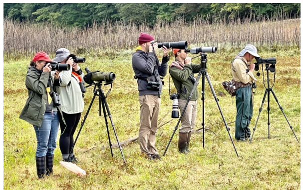
Birding at mudflats at Triadelphia Reservoir on September 25