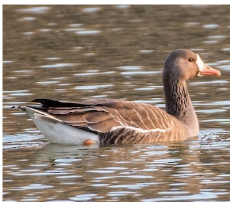
Greater White-fronted Goose

B irders not only enjoyed one of the warmest winters on record with no measurable snow, but were rewarded with numerous unusual birds.