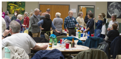
HCBC members enjoy the return of the annual potluck.

It can, at times, be difficult to remember life before the Covid-19 pandemic. Early in 2020, the Howard County Bird Club (HCBC) took measures to keep members safe while still providing opportunities to learn, explore, and socialize. Field trips were initially cancelled early in 2020, slowly returning with mask requirements and limits on the number of participants. Events that previously occurred in-person, including club programs, tally rallies, and the annual potluck, were switched to virtual events or cancelled. Sometimes it felt as though things would never return to normal. While we may not be fully there, the 2022-23 year brought us closer than ever. HCBC continued to provide field trip opportunities, hosted a wonderful in-person 50th anniversary celebration weekend, and welcomed the much-anticipated return of the annual potluck! As of January 2023, monthly meetings changed from exclusively Zoom to a hybrid format so that those who were comfortable meeting in person could again attend at the Robinson Nature Center. Thanks to everyone's patience, understanding, and hard work, the HCBC had a truly amazing birding year!