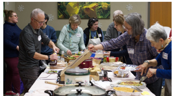
Club members enjoy a variety of dishes and a chance to socialize at the long-awaited return of the annual potluck.