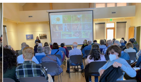
The 50th anniversary celebration features many events, including field trips and a commemorative event at Gudelsky Environmental Education Center.