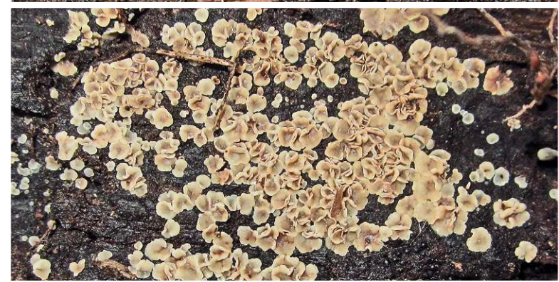
OVERALL (sp.1): Morning Choice Trail, PVSP, 12/18/2015, B. Ott. CLOSEUP (sp.1): Morning Choice Trail, PVSP, 12/18/2015, B. Ott. OVERALL (sp.2): Wincipin Trail, 12/302015, J. Solem.