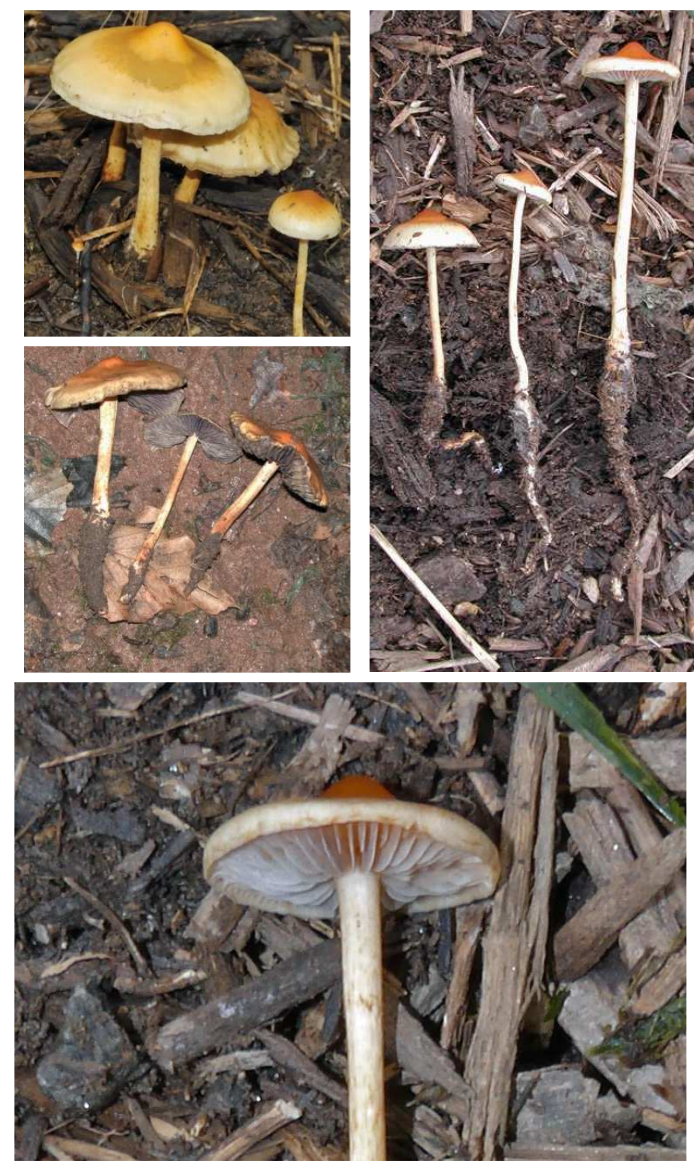
OVERALL: Western Regional Park, 9/24/2011, CAP, STALK, ROOT: Western Regional Park, 9/24/2011, CAP, STALK, ROOT: Western Regional Park, 9/25/2011, GILLS, STALK: Western Regional Park, 9/25/2011