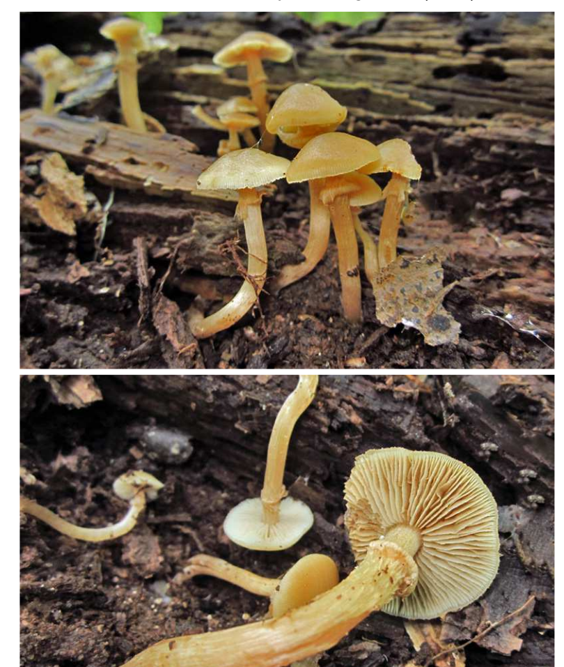
OVERALL: Gorman Stream V"lley NRA, 5/10/2016, GILLS and STALKS: Gorman Stream Valley NRA, 5/10/2016