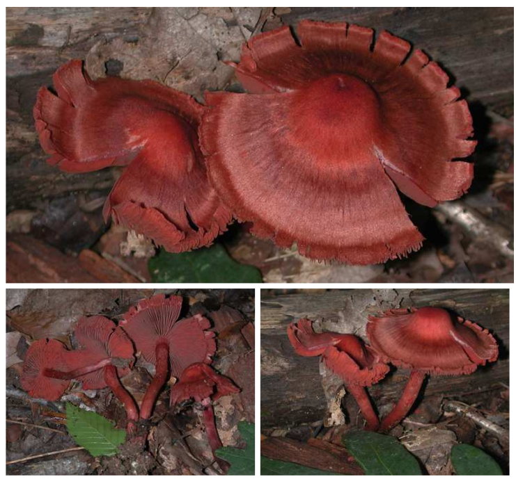
TOPS: Robinson Nature Center, 9/12/2011, GILLS and STALKS: Robinson Nature Center, 9/12/2011, OVERALL: Robinson Nature Center, 9/12/2011