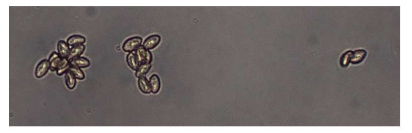
SPORES (7.6-8.4 X 4.3-4.7 µm): Robinson Nature Center, 9/12/2011, R. Solem.

References: BBH 172. BRBD 128. E&S 156. Stu 182fn.