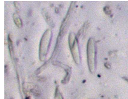
SPORES (12.6 – 14.2 X 3.2 – 3.8 μm): Mount Pleasant, 12/27/2015, R. Solem.

http://www.flickr.com/photos/21189203@N05/3469877654/ [in French])