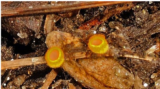
CLOSEUP: Mount Pleasant, 12/27/2015, B. Ott. OVERALL: Mount Pleasant, 12/27/2015, B. Ott. OVERALL: Pigtail 4/4/2011, R. Solem. CLOSEUP: Pigtail 4/4/2011, R. Orr.