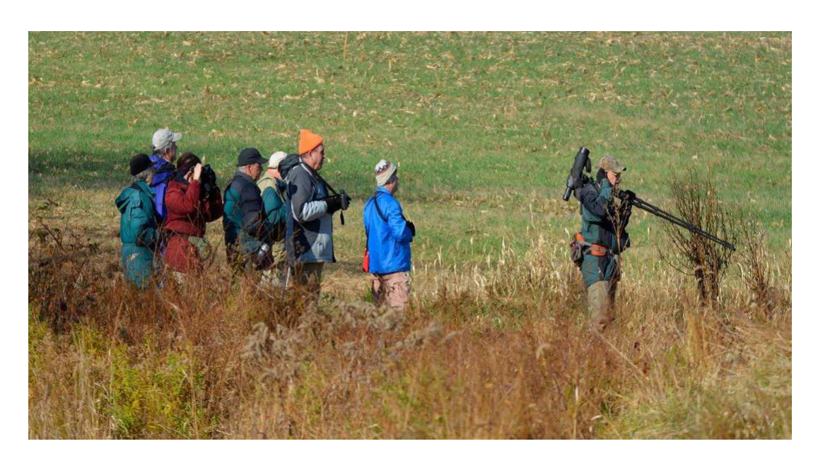
Group