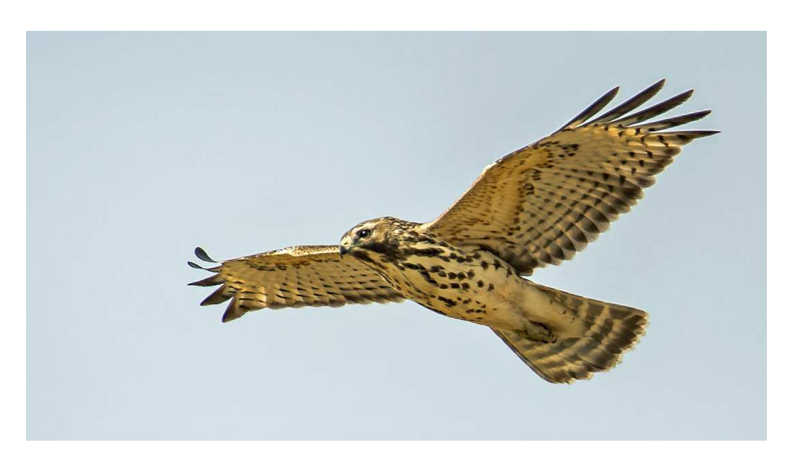
Immature Red-shouldered Hawk