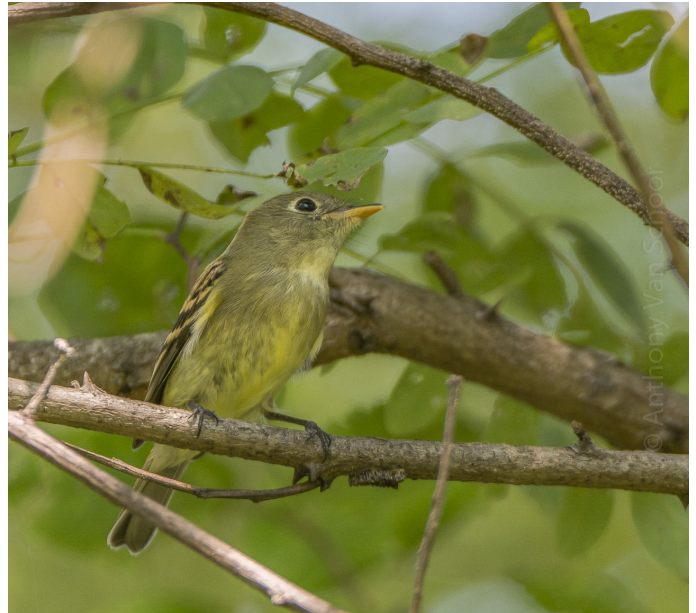
Yellow-bellied Flycatcher at Mt. Pleasant

One was also found there on 9/10 (AVS, ph.) in the area east of the community gardens; later that day it moved to the mature conifers near the upper part of the driveway (BO; HPt) and was found there again on a field trip 9/13 (DCm+); by 9/15, it had returned to its original location (AVS). Identification was eventually verified (JHf, BHb, MHf, MLg). Another was at Cavey La 9/24 (JHf, RRf). A Least Flycatcher on 10/1 at Cavey La (RRf, ph.) established a new late date [9/29/72].