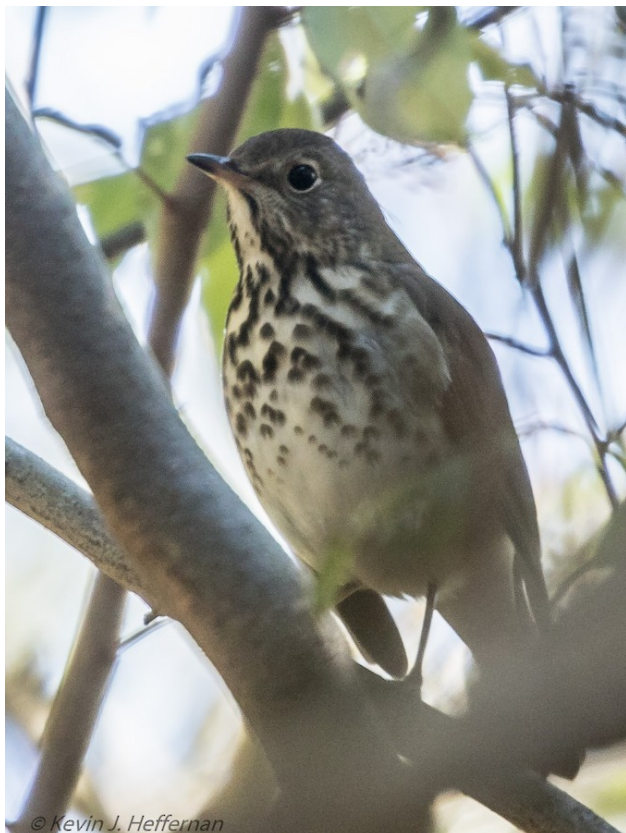
Gray-checked Thrush at MPEA

late Veery was recorded on 10/13 at Cavey La ( RRf-NFC ). One Gray-checked Thrush was seen at LKELK 9/26 ( ALw ) and several were reported from Cavey La ( RRf ); there were also a scattering of reports from MPEA, with the last heard there the morning of 10/20 ( KS, HPt ), seen and photographed that afternoon ( Ke/KaHf, JS ). Eye-opening was the fact that NFC equipment at Cavey La picked up nocturnal Gray-