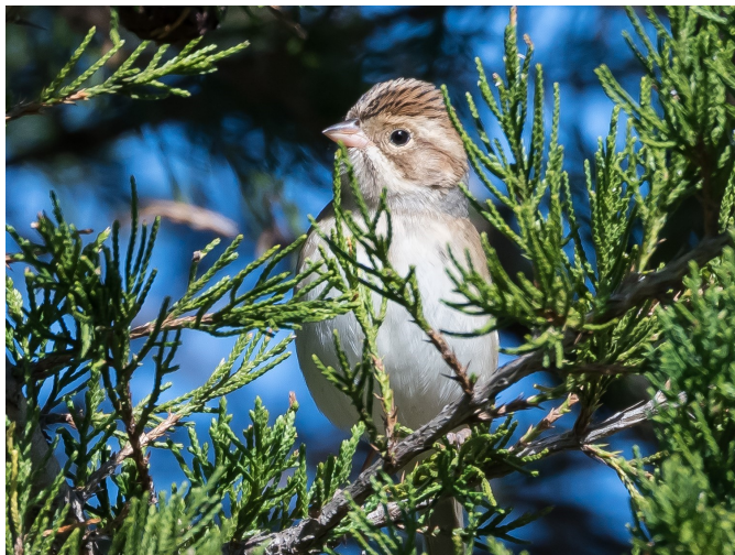
Clay-colored Sparrow at Mt. Pleasant

Twenty-four Chipping Sparrows were counted at MTPLT on 10/4 (KS). For an infrequent, hard-to-identify species, Clay-colored Sparrows were unusually cooperative. Two at MTPLT on 10/1 (BO) beat the arrival date by a day [10/2/13 - B. Ott]. At least one was seen for two months, with the final sighting 11/2 (JW), the third latest. Vespers were first detected at MTPLT 9/27 (AVS). They were also seen on 10/22 at W. Friendship Pk (JCu), 10/27 at Cavey La (RRf), and 11/11 at Waterford Farm (WE, JHr+). The final Grasshopper Sparrow of the season was picked up at MTPLT 10/29 (HPt, ALw), the second latest record. A pale Nelson's appeared in the swale at MTPLT on 10/2 (THg; DCm). A leucistic Song Sparrow with a white head at Fox Chase 10/18 (AVS) and again 11/30 (JCu) was a striking bird. As usual, Lincoln's were well-reported with the four at Meadowbrook 10/2 (BO) the high; three at MTPLT 10/3 were close behind (JHf). The high count of Swamp Sparrows was 50 at U of M Central Farm 10/14 (WE+). The spike to 70 White-throats at MTPLT 10/22 (RRf+) was an indication that winter was on its way.