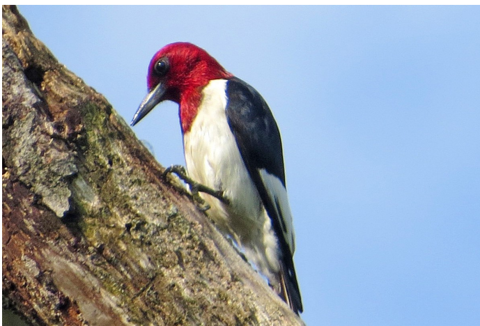
Red-Headed Woodpecker at Fox Chase