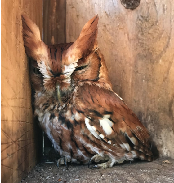
Eastern Screech-Owl in Cavey Lane Nest Box