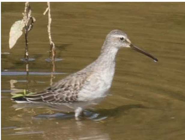
Stilt Sandpiper at Brown’s Bridge

Among the few notable shorebirds this season was a Stilt Sandpiper at Brown’s Bridge (BRNBR) 9/9 (KHf, HPt). Two Pectoral Sandpipers were there 9/4 (DCm). An American