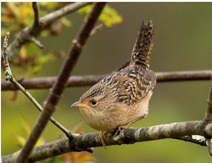
Sedge Wren at Mt. Pleasant