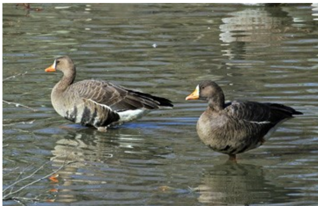
Greater White-fronted Geese

(CENPK) 11/11 (EHs), for the eighth county record. They were seen intermittently with a flock of ~24 Canada Geese (HPT) until 11/25 (FSh). A Cackling Goose was detected at CENPK 11/26 (K&KnHf). The county's second Trumpeter Swan hung around into a third season spending much of its time on a pond east of US 29/Broken Land Pkwy. It was last reported 9/13 (JHf). Tundra Swans were scarce.