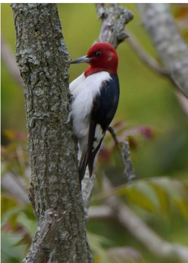
Red-headed Woodpecker

A leucistic Mourning Dove was present in a western county yard from late Oct to 11/2 ( SBI, ph. ). Black-billed Cuckoos were reported at CENPK 8/7 ( EHS ) and 8/24 ( MKw ), as well as at MTPLT 8/8 ( NDB ). Great Horned Owls announced their presence frequently at Duvall Rd this season ( KTf ), while a pair at Hallmark engaged in courtship vocalizations from 11/21 on ( Web ). Common Nighthawks began a leisurely migration with one on 8/24 at CENPK ( MKw ), a high of 20 over Owen Brown on 9/1 ( DCm ), and three stragglers on 10/1 at Schooley Mill Pk, tying the third latest record ( JHr ). Thirty Chimney Swifts at McNeal Rd 10/15 were the last of the season ( MW ). Three Ruby-throated Hummingbirds were counted at Waterloo Pk on 9/21 ( S, A, & RWt ). No hummingbirds were detected after mid-October. Red-headed Woodpeckers made a fine showing. The bird at Linden Church Rd, which had wintered from December 2013, stayed the summer and was still being seen 9/18 ( HFk ). HCFC tallied eight, a new high for the count ( W&SE-5;TSt, PZ, R&SPo-3 ). One also appeared at Cavey La 9/26 ( RRf ). Northern Flickers totaled 13 on a field trip at Western Regional Pk 9/28 ( JCu+ ).