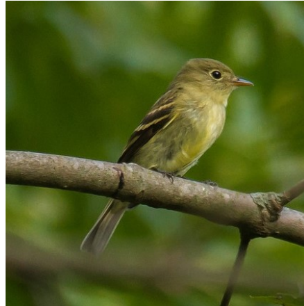
Yellow-bellied Flycatcher

Surprisingly, the Olive-sided Flycatcher sighted at Manahan Dr 8/19 ( BO+ ) was the lone report. Yellow-bellied Flycatchers are notoriously difficult to identify by sight. Two documented reports were received. A