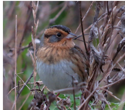
Nelson’s Sparrow

did not appear until 11/27 at MTPLT (BO-12). Late October is usually the best time to locate large flocks of Chippings . The 100+ at Cavey La 10/21 (RRf) tied the second largest flock. This was an excellent season for Vespers . From 9/24 at W. Friendship Pk (KS-1) to 11/15 at MTPLT (BO-1), the second latest date, they were spotted at five sites with a high on 10/31 of at least eight at Waterford (BO) and two at Schooley (NM). Grasshoppers lingered long enough to produce a third latest date of 10/28 at Meadowbrook Pk (JW) and a second latest date of 10/31 at Waterford (BO). Nelson’s was the choice sparrow of the season. One was discovered at MTPLT 10/7 (BO). It hung around for at