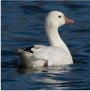
Ross's Goose by Rodolpho Quinio

Ross's, birders also turned up more than one Cackling Goose with a peak of three on 11/22 ( CHR ). Two early Cacklers at a pond along So. Trotter Rd 10/12 were carefully identified ( WE ). Mid-November brought good numbers of Tundra Swans : 11/11 Duvall ( KTf-40 ), 11/13 Alpha Ridge Pk ( JW-35 ), and 11/15 Burleigh Manor ( MKw-42 ).