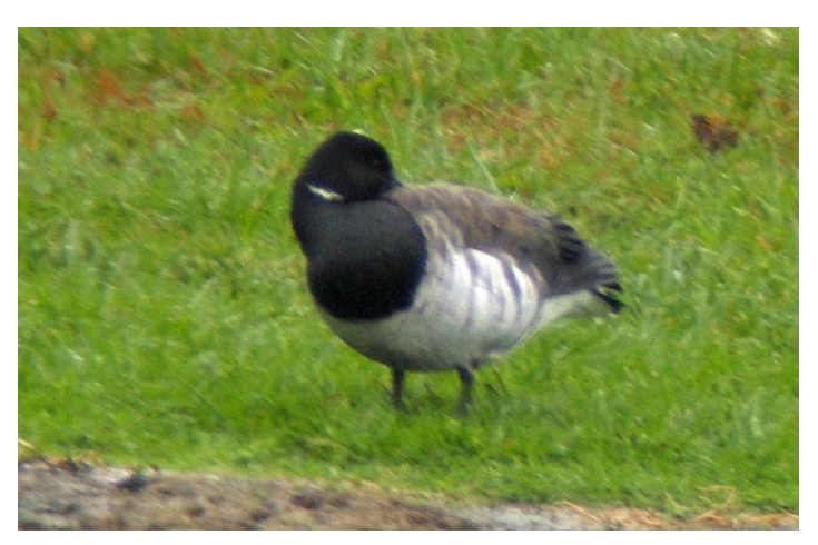
Brant at Fulton Pond, October 30, 2012