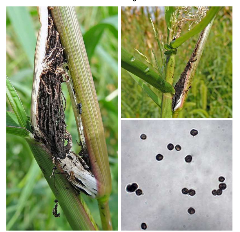
CLOSEUP: Waterford Farm, 9/15/2014, R. Orr. OVERALL: Waterford Farm, 9/15/2014, R. Orr. SPORES (11.6 – 12.8 X 10.6 – 11.0 \mu m): Waterford Farm, 9/15/2014, R. Solem.