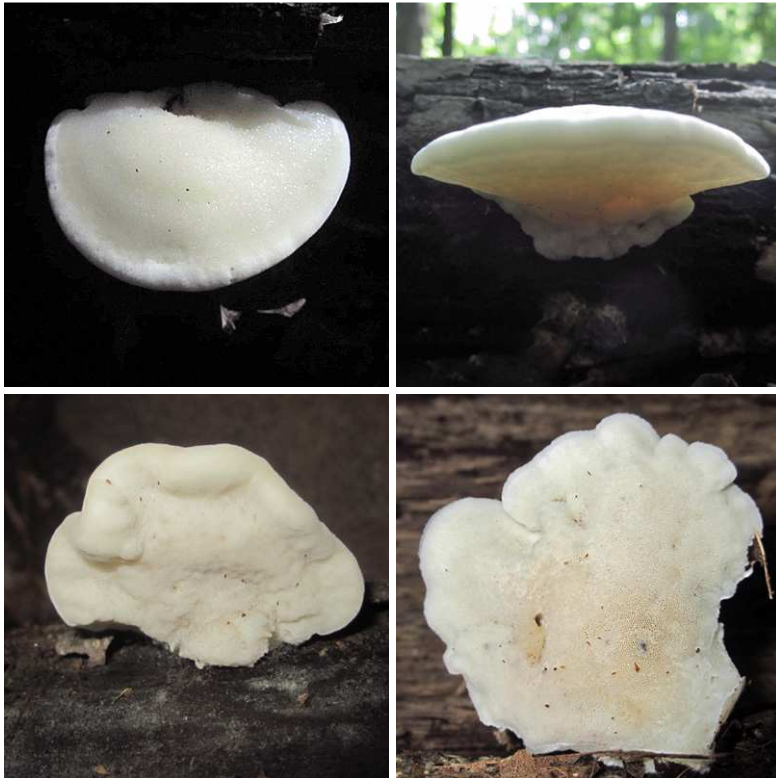
TOP: Manor Woods ES, 7/18/2019, J. Solem . SIDE and PORES: Manor Woods ES, 7/18/2019, J. Solem . PORES: Wincopin Trail, 5/28/2018, J. Solem . PORES: Gorman Stream Valley NRA, 8/27/2018, J. Solem .