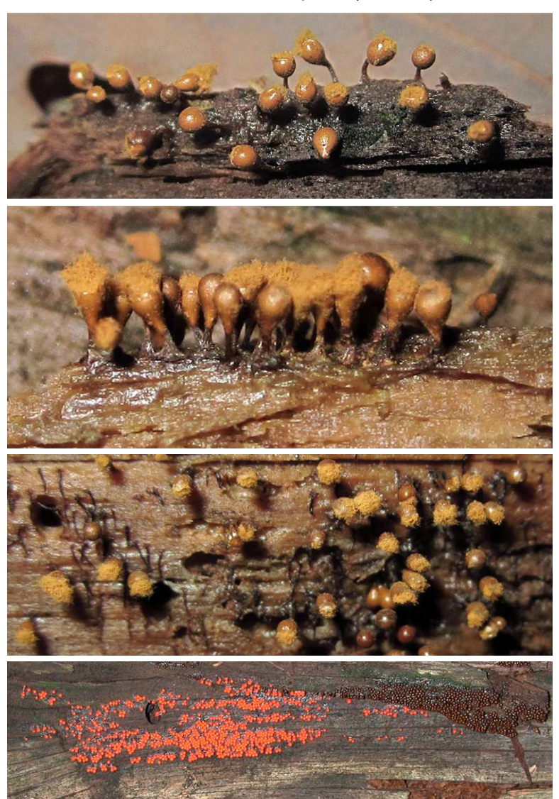
SIDE: Wincopin Trail, 10/30/2018, SIDE: Robinson Nature Center, 10/18/2017, TOPS: Robinson Nature Center, 10/18/2017, OVERALL (young): Wincopin,10/10/2008