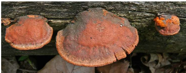
UPPER SURFACE and PORES: High Ridge Park, 9/9/2009, R. Solem . PORES: MPENA, 3/29/2018, J. Solem . SIDE: MPENA, 3/29/2018, J. Solem . UPPER SURFACE (old): Old Frederick Road, 5/22/2009, R. Solem .