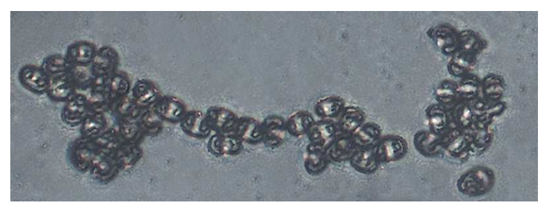
SPORES (5.4-6.2 X 3.6-4.3 µm): MPENA, 10/13/2010, R. Solem.

References : BBF 250, 310. BBH188. Bni 333. K&M 363. K&M 363. Kuo. Lin 728, 202. M&M 255fn. Phi 227. Roo 77. Stu 218.