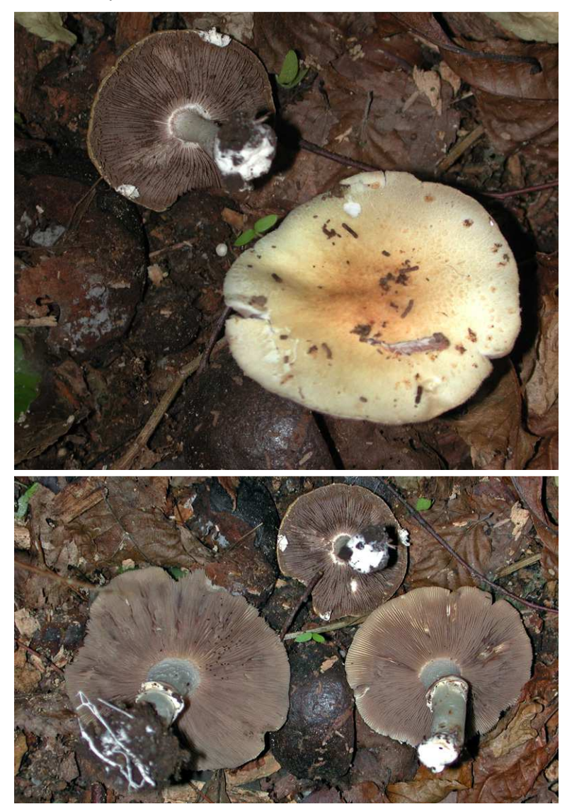
GILLS, STALK and CAP: GILLS, RING, STALKS and RHIZOMORPHS