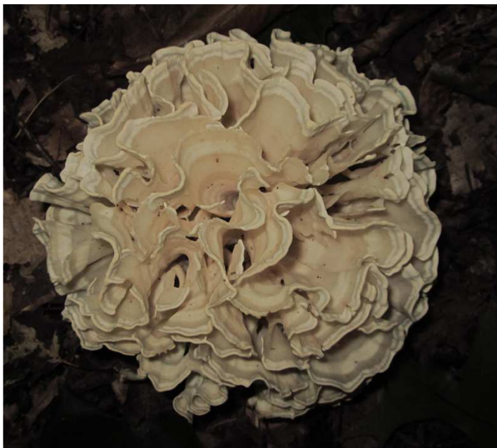
OVERALL: North Laurel Park, 8/4/2008, OVERALL: Murray Hill, 9/14/2015