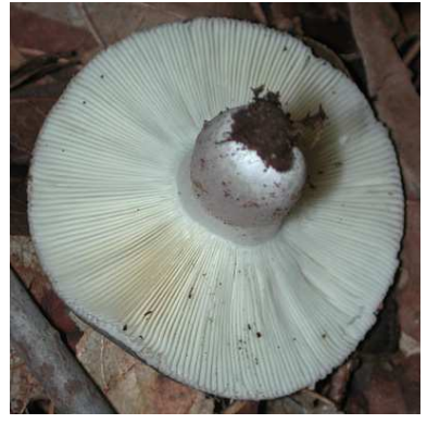
OVERALL: Rockburn Branch Park, 8/12/2009, SIDE: Rockburn Branch Park, 8/12/2009, GILLS: Rockburn Branch Park, 8/25/2010