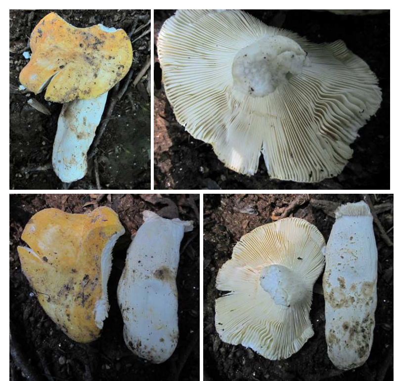
SIDE: Gateway Business Park, 6/28/2017, GILLS: Gateway Business Park, 6/28/2017, TOP and STALK: Gateway Business Park, 6/28/2017, GILLS and STALK: Gateway Business Park, 6/28/2017