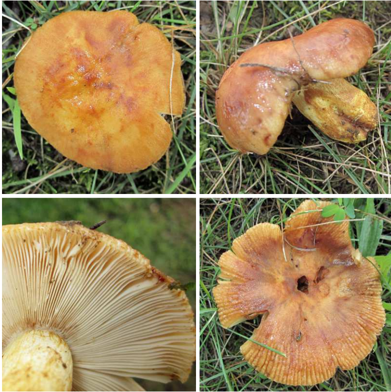
TOP: Hammond Village, 8/15/2017, J. Solem. SIDE (older): Hammond Village, 8/15/2017, J. Solem. GILLS and STALK: Hammond Village, 8/15/2017, J. Solem. TOP (old): Hammond Village, 8/15/2017, J. Solem.