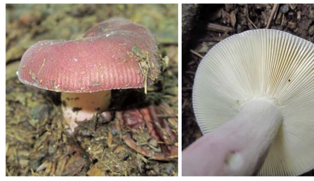
TOP and GILLS: Gorman" Stream Valley NRA, 8/29/2011, SIDE: Gorman Stream Valley NRA, 8/29/2011, SIDE: Schooley Mill Park, 8/1/2018, GILLS and STALK: High Ridge Park, 8/17/2017