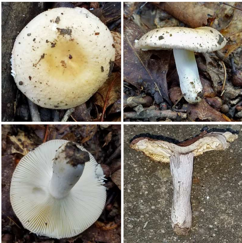
TOP: Western Regional Park, 8/24/2020, J. Solem. SIDE: Western Regional Park, 8/24/2020, J. Solem. GILLS and STALK: Western Regional Park, 8/24/2020, J. Solem. CUT SURFACE: Western Regional Park, 8/24/2020, J. Solem.