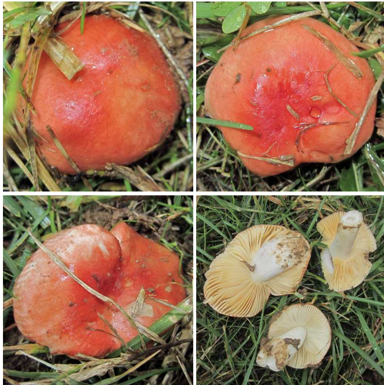
TOP: Schooley Mill Park, 11/9/2017, TOP (older): Schooley Mill Park, 11/9/2017, TOP (oldest): Schooley Mill Park, 11/9/2017, GILLS and STALK: Schooley Mill Park, 11/9/2017