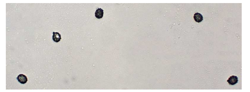
SPORES (8.5-9.8 X 7.6-8.1 µm): Pigtail, 10/6/2009, R. Solem.