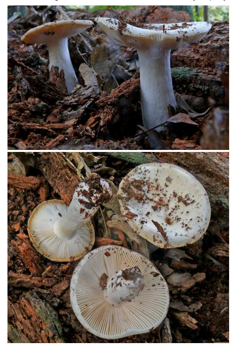
OVERALL: Pigtail, 10/6/2009, R. Solem. GILLS, STALKS and TOP: Pigtail, 10/6/2009, J. Solem.