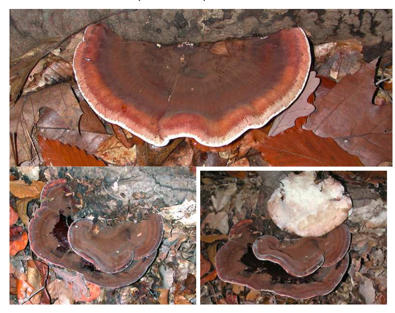
UPPER SURFACE: Savage Park,10/27/2008, OVERALL: Savage Park,10/27/2008, PORES and UPPER SURFACES: Savage Park,10/27/2008

Rhodofomes cajanderi (P. Karsten) B.K. Cui, M.L. Han & Y.C. Dai