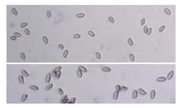
SPORES 9.4 – 10.0 X 3.7 – 4.6 μm): Murray Hill, 8/31/2017, R. Solem. SPORES (7.9-9.2 x 3.9-4.4 μm): Savage Park, 9/12/2018, R. Solem.

References : Bar 116. BBH 304. Lin 408fn. M&M 350. Rog.