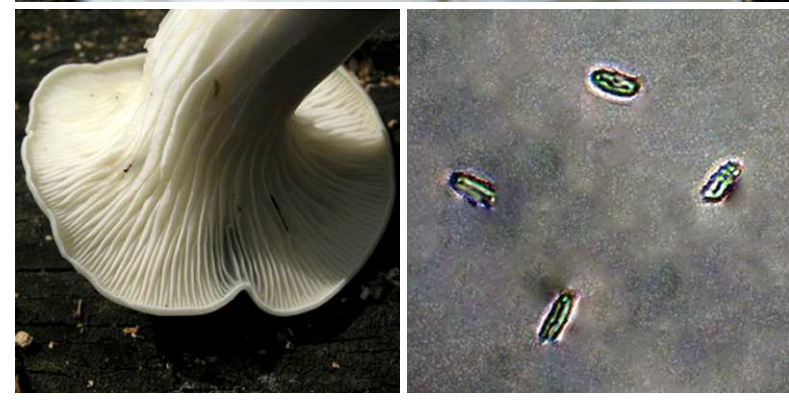
OVERALL: St. Michaels Road, 6/28/2010, J. Solem. SIDE (young): St. Michaels Road, 6/28/2010, S. Earp. GILLS and STALK: St. Michaels Road, 6/28/2010, S. Earp. SPORES: (8.7 – 10.2 X 3.4 – 3.8 μ): St. Michaels Road, 6/28/2010, R. Solem.