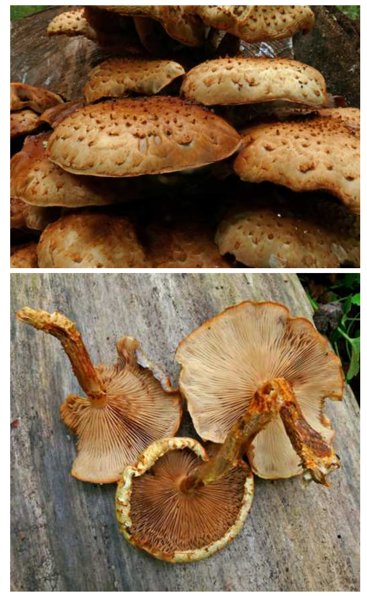
SIDE: Henryton, PVSP, 10/2/2009, R. Solem. GILLS and STALKS: Henryton, PVSP, 10/2/2009, R. Solem.