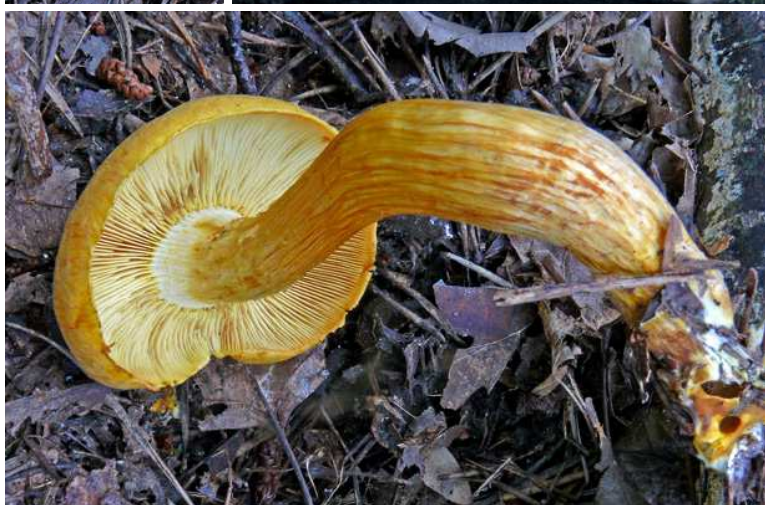
TOP: Rockburn Branch Park, 9/22/2009, GILLS, STALK, RING REMNANT: Rockburn Branch Park, 9/22/2009

OVERALL: Rockburn Branch Park, 9/22/2009