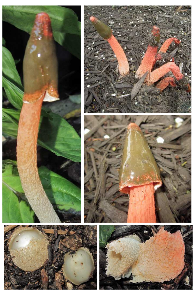
OVERALL: Ellicott City, 10/2/2016, OVERALL:Schooley Mill Park, 5/29/2018, HEAD:Schooley Mill Park, 5/29/2018, IMMATURE (eggs): Ellicott City, 10/2/2016, OLD STALK BASES: Ellicott City, 10/2/2016