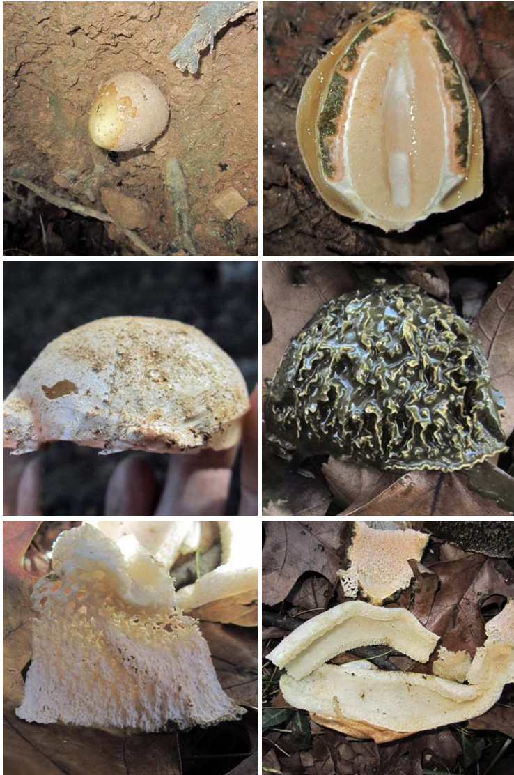
OVERALL (egg): Robinson Nature Center, 10/18/2017, SPLIT (egg): Robinson Nature Center, 10/18/2017, ATTACHMENT POINT (egg): Robinson Nature Center, 10/18/2017, FERTILE SURFACE: Robinson Nature Center, 10/18/2017, VEIL: Robinson Nature Center, 10/18/2017, SPLIT STALK: Robinson Nature Center, 10/18/2017