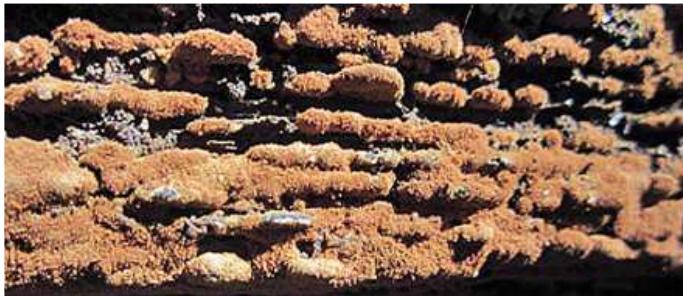
OVERALL: Morning Choice Trail, 12/9/2015, J. Solem. CLOSEUP: Morning Choice Trail, 12/9/2015, J. Solem. CLOSEUP: Morning Choice Trail, 12/9/2015, J. Solem.