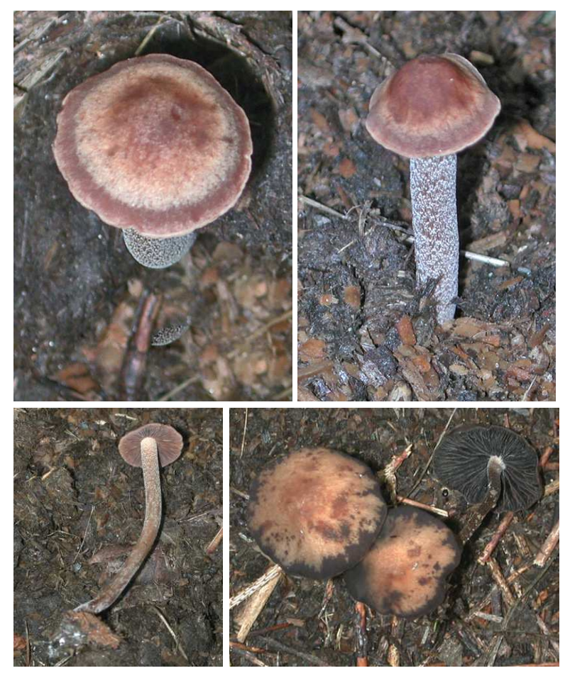
TOP: Long Corner, PRSP, 7/16/2010, J. Solem . OVERALL: Long Corner, PRSP, 7/16/2010, J. Solem . GILLS and STALK: Long Corner, PRSP, 7/16/2010, J. Solem . OLD SPECIMENS: Long Corner, PRSP, 7/16/2010, J. Solem .