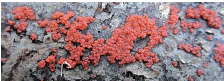
OVERALL: Western Regional Park, 9/28/2014, OVERALL: Western Regional Park, 10/30/2014