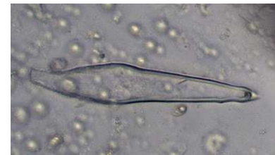
CYSTIDIUM (90.0 x 14.9 μm): Robinson Nature Center, 10/6/2016, R. Solem .