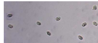
SPORES (8.4-9.7 x 5.8-6.7 μm): Robinson Nature Center, 10/6/2016, R. Solem .

ID: Pinkish-purplish (grayish-brown in age); convex, striated. Habitat: Scattered, groups. On well-decayed, mossy hardwood stumps and logs. Cap: 0.6 – 2.8" [1.5 – 7 cm] Grayish-/pale-brownish (white in age). Bald. Convex/broadly conical. Prominent umbo. Margin faintly lined (strongly lined/splitting in age). Moist when fresh. Odor of bleach (or not). Tastes acidic. Gills: Pale grayish/whitish. Close. Attached w/notch. Spores: White . Ellipsoid, smooth. Cystidia: Fusiform-ventricose. Stalk: 1.6 – 3.9" x 1/8 – 1/4" [4 – 10 cm x 3 – 6 mm] Silvery-grayish (whitish in age) w/ tiny whitish fibers (bald in age). Bottom half may discolor brownish. Frequency: Uncommon. Locations: ROBNC. Notes: Mycobank 181423. Robinson Nature Center specimen identified by examination of spores by R. Solem. (No bleach odor in 10/6/2016 specimens.) References: K&M 288. Kuo.