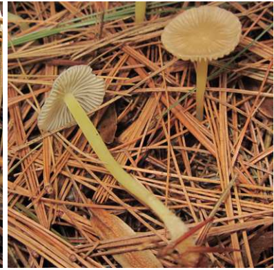
OVERALL: Annapolis Rock, PRSP, SIDE: Annapolis Rock, PRSP, GILLS and STALK: Annapolis Rock, PRSP