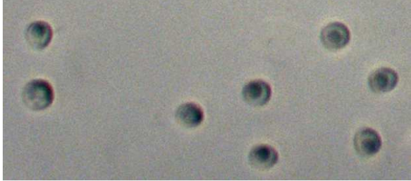
TOP: Montgomery County, 7/5/2018, A. Looker. SPORES (4.5-5.2 X 3.8-4.6 µm): Montgomery County, 7/5/2018, R. Solem.