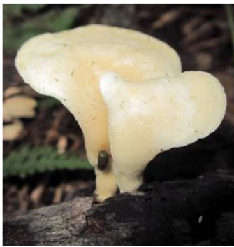
OVERALL: Murray Hill, 8/31/2017, J. Solem. TOP: Nichol's Cove, 8/31/2012, J. Solem. SIDE: Murray Hill, 8/31/2017, J. Solem. PORES: Nichol's Cove, 9/10/2012, J. Solem. SIDE: Pigtail, 8/12/2015, J. Solem.