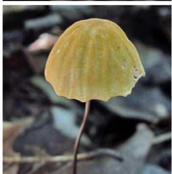
OVERALL: Wincopin Trail, 8/8/2018, J. Solem CAP: Pigtail, 8/9/2013, J. Solem. GILLS and STALK: Wincopin Trail, 8/8/2018, J. Solem OVERALL: Wincopin Trail, 10/8/2014, J. Solem.