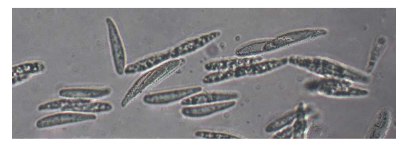
SPORES (18.9 – 20.3 X 3.2 – 3.6 μm): Wincopin Trail, 10/8/2014, R. Solem .

References : Bar 263. BBF 202, 301. BBH 132. Bni 182. E&S 212. K&M 273. Lin 775, 67. M&M 198. Phi 90. W&L 410.