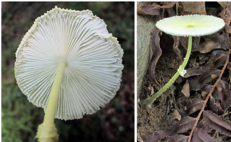
TOP: Robinson Nature Center, 7/26/2012, GILLS, RING, STALK: Robinson Nature Center, 7/26/2017, SIDE: Robinson Nature Center, 7/26/2012