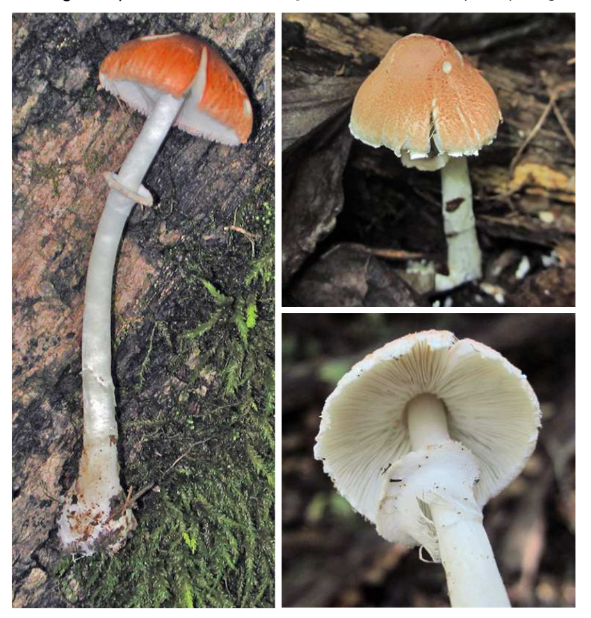
OVERALL: MPENA, 8/19/2010, SIDE: Gorman Stream Valley NRA, 10/17/2016, GILLS, RING, and STALK: Gorman Stream Valley NRA, 10/17/2016

Leucoagaricus rubrotinctus (Peck) Singer