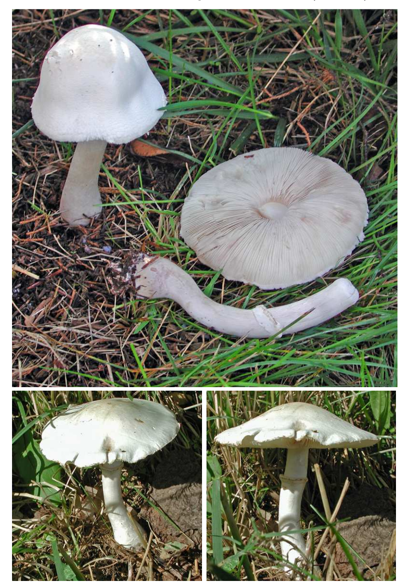
OVERALL, GILLS, STALK: Rockburn Branch Park, 9/14/2008, OVERALL: Cedar Lane Park, 9/15/2008, SIDE: Cedar Lane Park, 9/15/2008

Leucoagaricus leucothites (Vittadini) Bon