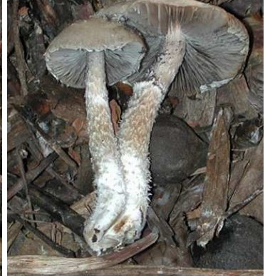
OVERALL: Rockburn Branch Park, 11/11/2010, GILLS and STALK: Rockburn Branch Park, 11/11/2010, SIDE: Rockburn Branch Park, 11/11/2010