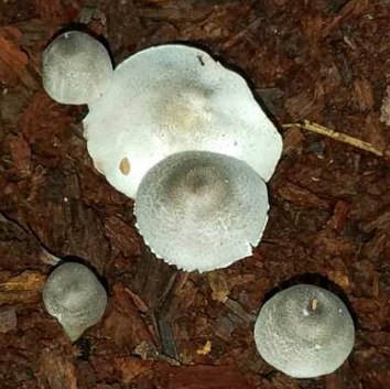
TOPS: Sykesville/River Road, PVSP, 8/20/2014, J. Solem. GILLS, STALKS, RINGS: Sykesville/River Road, PVSP, 8/20/2014, J. Solem.

OVERALL: Franciscan Friars, 8/9/2014, J. Solem .