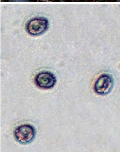
GILLS: Pigtail, 11/21/2009, R. Solem. TOP: Pigtail, 11/21/2009, R. Orr. OVERALL (top and gills): Rockburn Branch Park, 6/16/2009, R. Solem. GILLS: Big Branch, 10/9/2009, J. Solem. SPORES (3.9-4.2 X 2.8-3.2 µm): Pigtail, 11/21/2009, R. Solem.