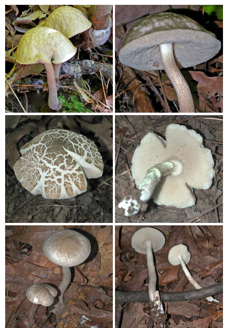
OVERALL: Long Corner, PRSP, 8/7/2009, R. Solem. PORES and STALK: Long Corner, PRSP, 8/7/2009, J. Solem. SPLIT CAP: Western Regional Park, 8/9/2009, J. Solem. PORES and STALK: Western Regional Park, 8/9/2009, J. Solem. OVERALL: Western Regional Park, 8/17/2011, J. Solem. PORES and STALKS: Western Regional Park, 8/17/2011, J. Solem.