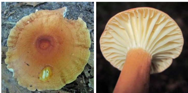
TOP: Wincopin Trail, 6/20/2012, J. Solem. OVERALL: Wincopin Trail, 8/27/2015, J. Solem. GILLS (and latex): Wincopin Trail, 6/20/2012, J. Solem. TOP: Gorman Stream Valley NRA, 8/2/2012, J. Solem. GILLS and STALK: Gorman Stream Valley NRA, 10/24/2018, J. Solem.