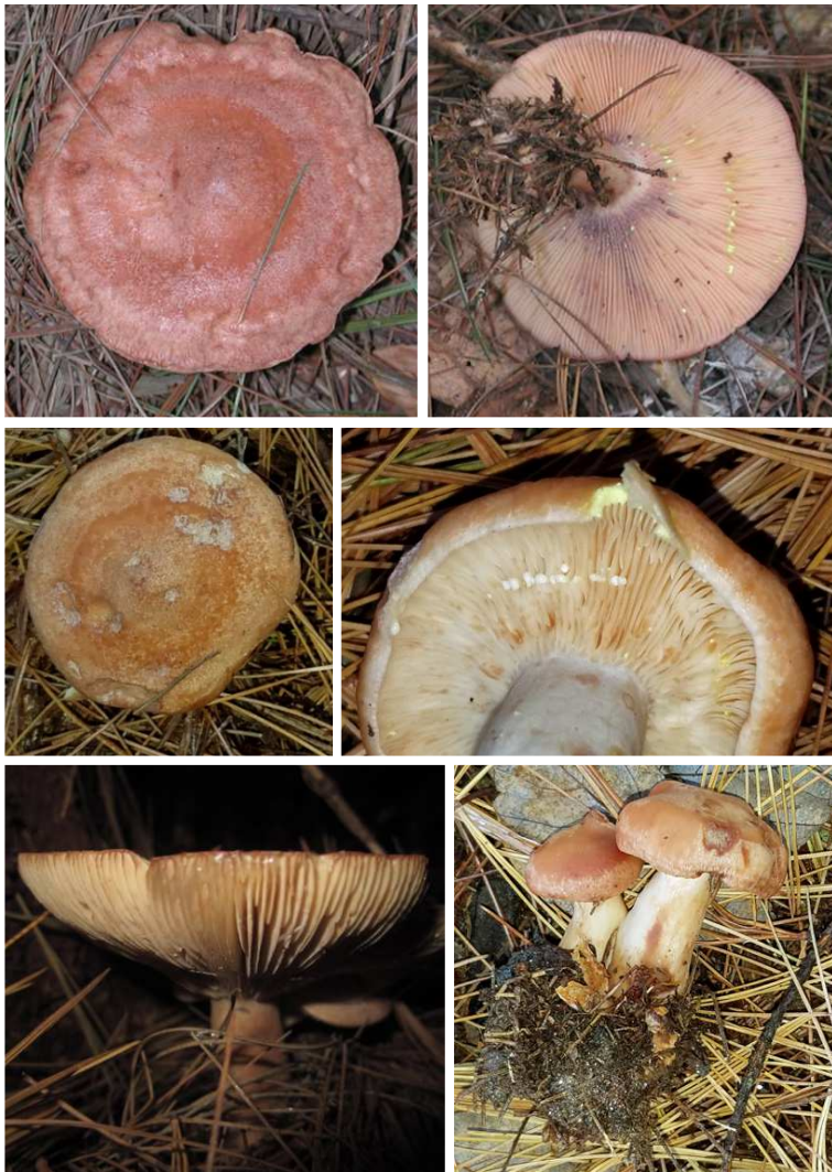
TOP: Browns Bridge, 10/16/2008, J. Solem . GILLS and LATEX: Browns Bridge, 10/16/2008, J. Solem . TOP: Hammond Village, 10/31/2020, J. Solem . GILLS and LATEX: Hammond Village, 10/31/2020, J. Solem . GILLS and LATEX: Annapolis Rock, PRSP, 11/4/2015, J. Solem . SIDE: Hammond Village, 10/31/2020, J. Solem .