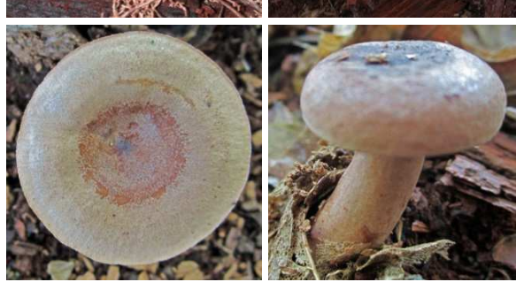
OVERAII: Rockburn Branch Park, 8/25/2010, TOP: Rockburn Branch Park, 8/25/2010, GILLS and LATEX: Rockburn Branch Park, 8/25/2010, TOP (young): Robinson Nature Center, 8/29/2012, SIDE (young): Robinson Nature Center, 8/29/2012